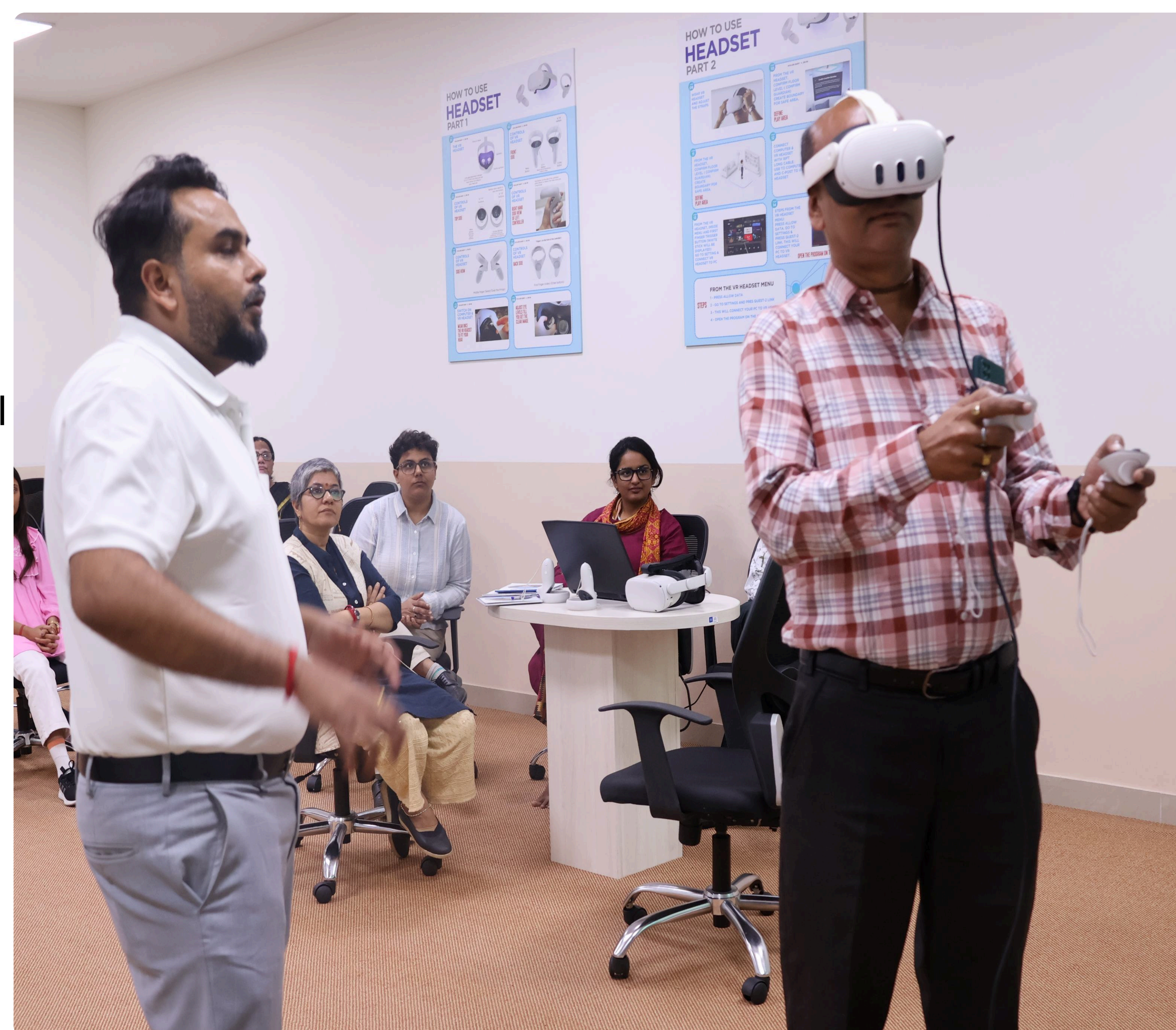
Interactive digital tools and virtual reality demonstration during the training