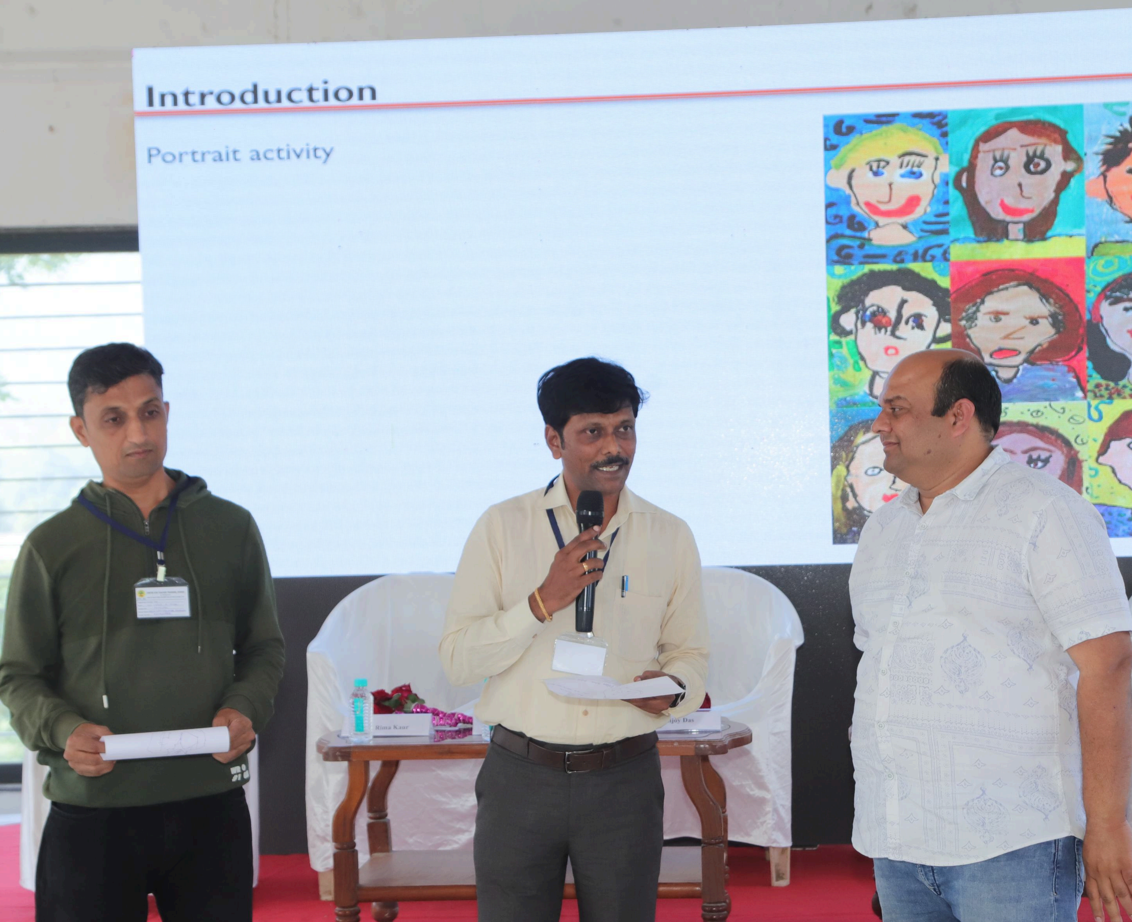
Principal sharing his experience of school management during the training