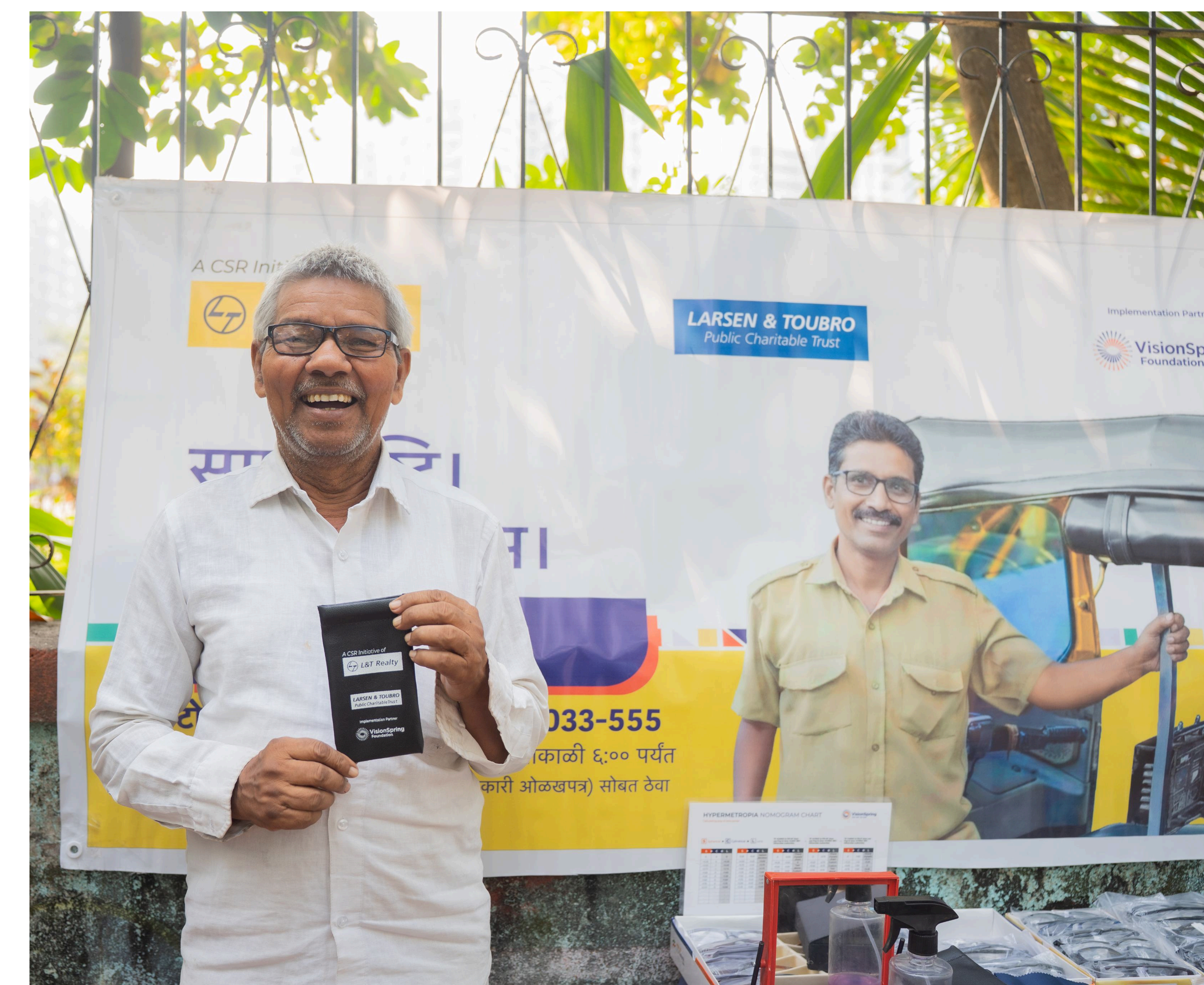
Auto Driver wearing new glasses post eye screening

Under LTPCT's Comprehensive Community Development Programme, a community-owned vegetable seedlings nursery in Vikramgad block of Palghar district has turned a critical agricultural gap into a viable income opportunity. Established on 10 November, the polyhouse nursery has produced over 2.8 lakh chilli seedlings, generating sales of ₹1.10 lakh in its first season and creating assets valued at ₹3.97 lakh for the Rabi season. Managed by trained farmers and transferred to a local Producer Company, the initiative reduces input costs, supports second-crop cultivation, and unlocks sustainable income while lowering distress migration.