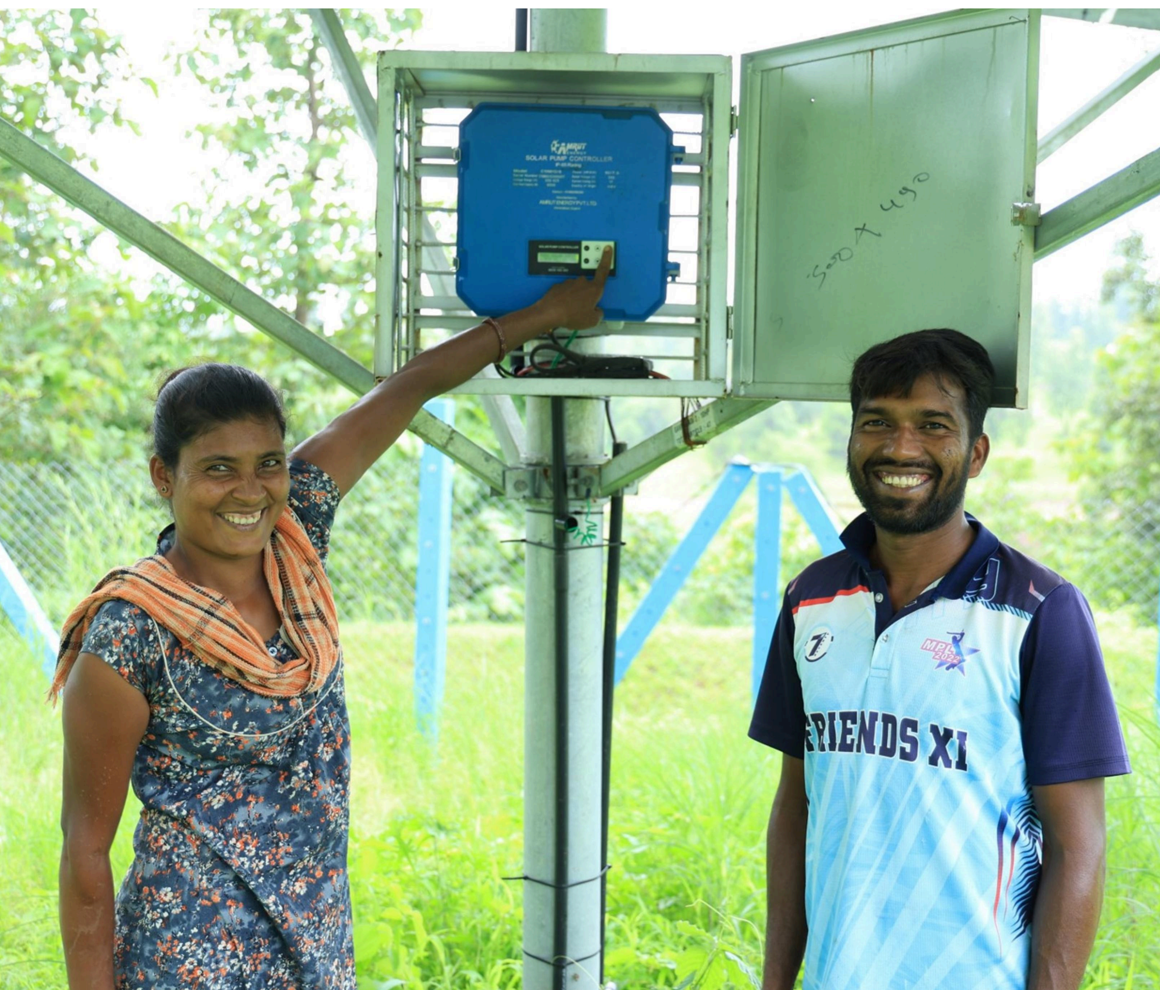
Community managed solar lift irrigation system in Subir

In regions where rainfall is abundant but infrastructure is limited, access to water can redefine livelihoods. This belief lies at the heart of LTPCT's Sankalp Water Resource Development Project supported by LTIMindtree in Subir block, Dang district, Gujarat - an initiative that won the ASSOCHAM National Water Award 2025 in the "Water for Community" category on 9th December 2025 at New Delhi.