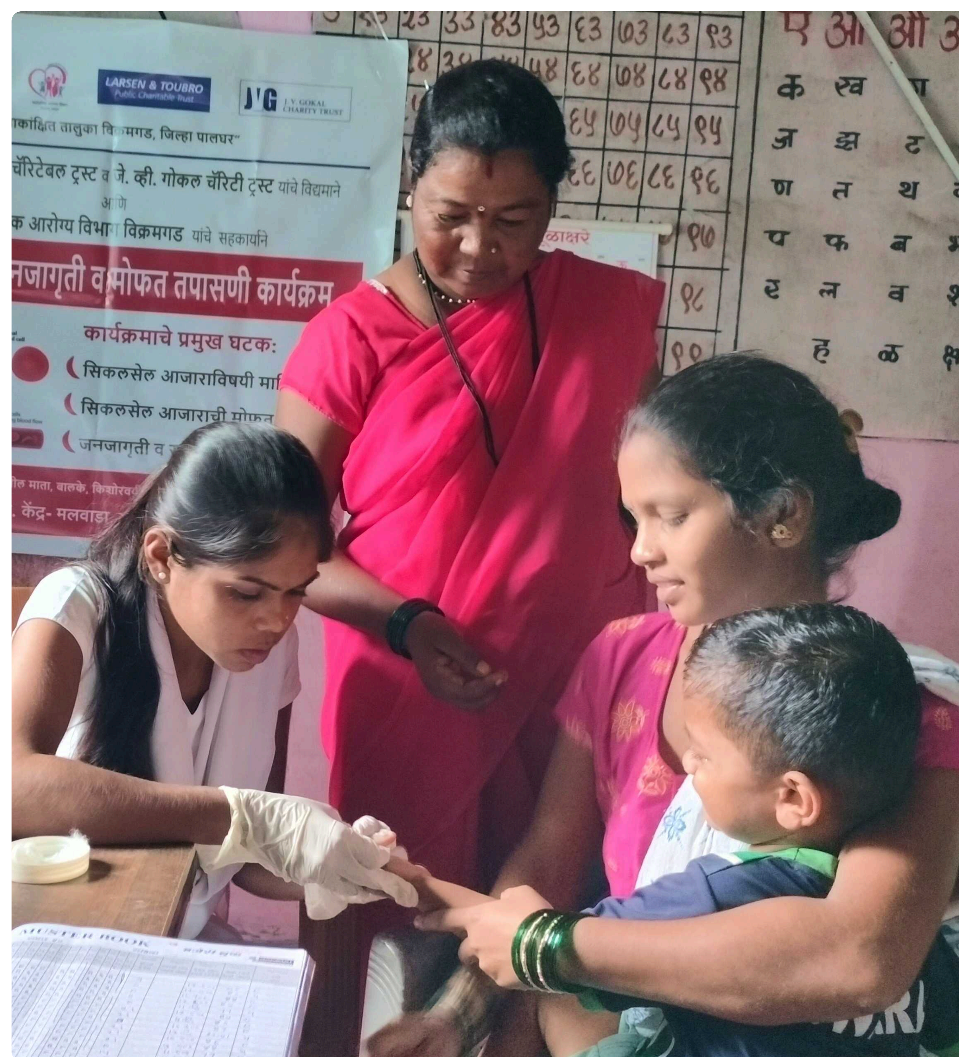
Screening for Sickle Cell at Anganwadi Center

Malwada, a small tribal village in Palghar's Vikramgad block, is witnessing a crucial health intervention to combat sickle cell disease. Launched in July 2025, the mass screening drive has already tested 3,710 people, identifying 287 provisional cases, with 20 carriers and 7 patients confirmed. Sickle cell disease, an inherited disorder affecting red blood cells, poses serious health risks, especially among tribal populations. LTPCT aims to reach 20,000 people in five months bringing preventive care and awareness to one of India's most vulnerable tribal belts.