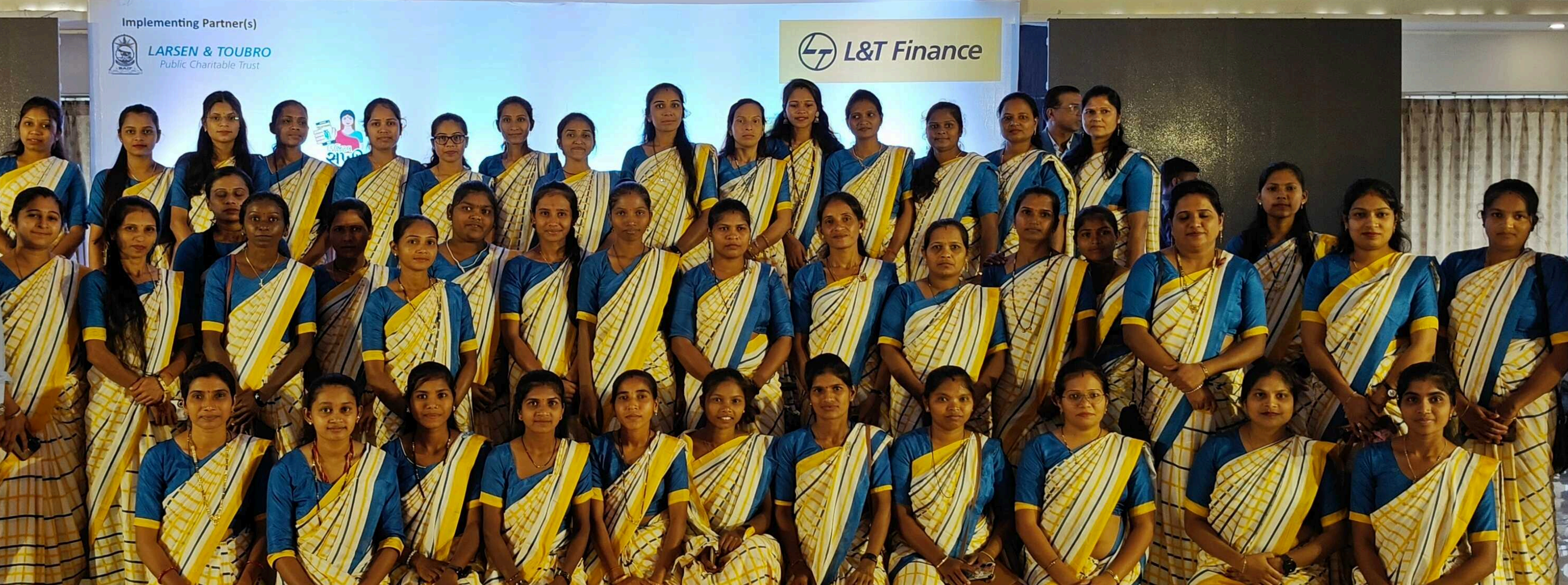
Digital Sakhis at the project inaugural event